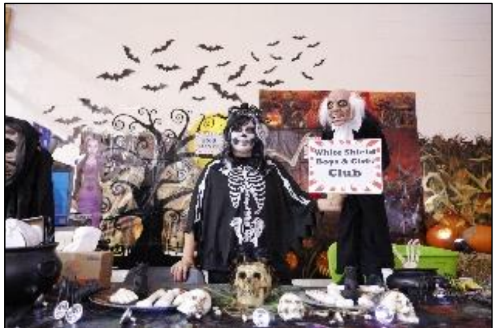
White Shield Boys and Girls club put a lot of effort into this Halloween booth and it looks like a winner. They had fun too.