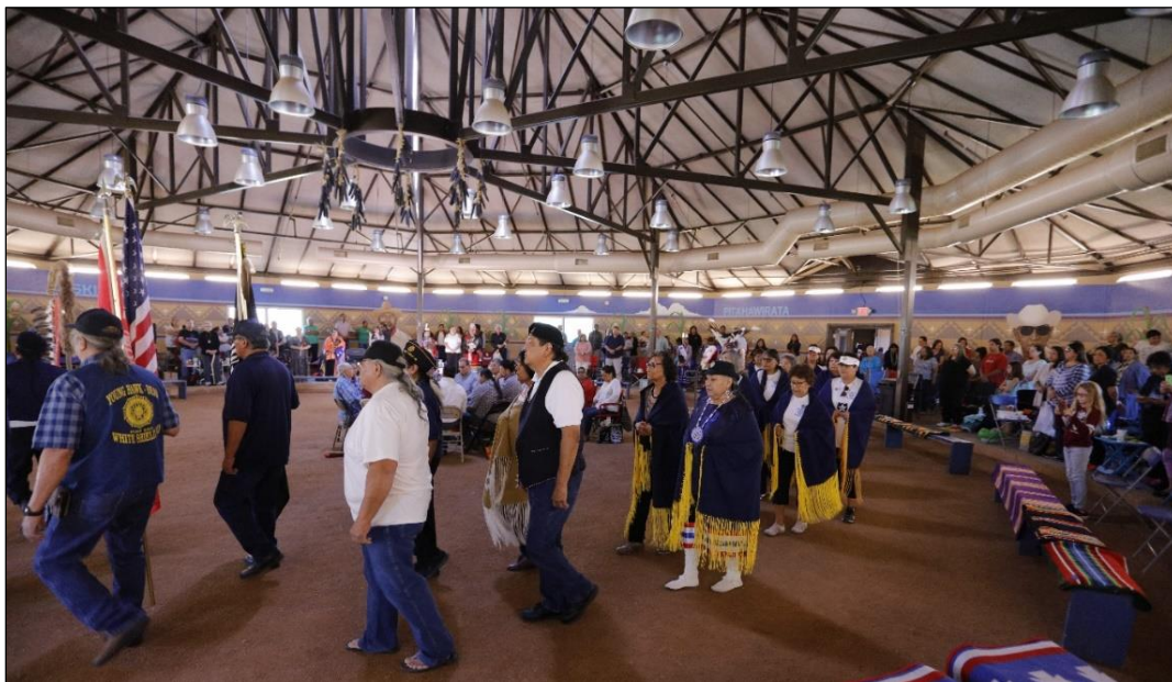
Arikara Veterans, Ladies Auxiliary, Head woman and man dancer and elders and other Arikara in Grand Entry at Pawnee Pow Wow.

The following day, they gathered for a ceremony and smoking of the Sacred Pipe in ceremony, and they sang traditional songs. After the ceremony, they were taken to a Pawnee historical museum and were served dinner. After the meal, a discussion was held about the language, ceremonies, and traditions of each tribe.