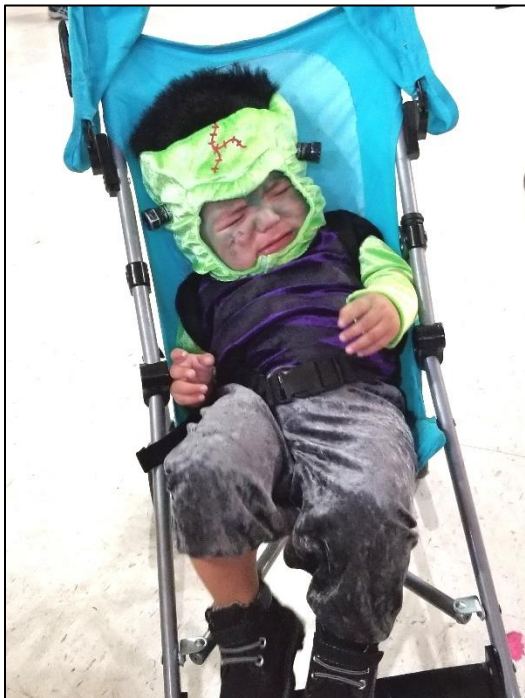
Get me out of this chair. I need candy!