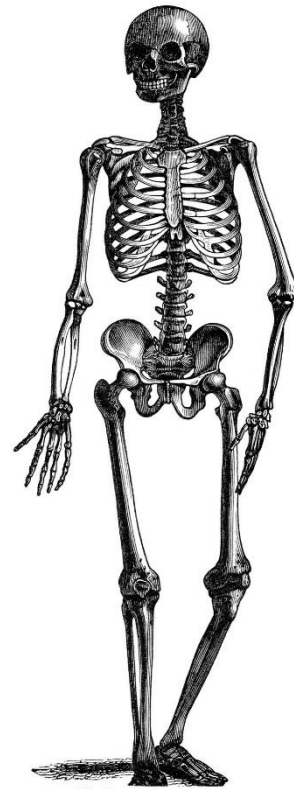
Fig. 1.—Skeleton of Man.