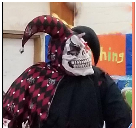
Geez, I scared myself, Red Star Fox.