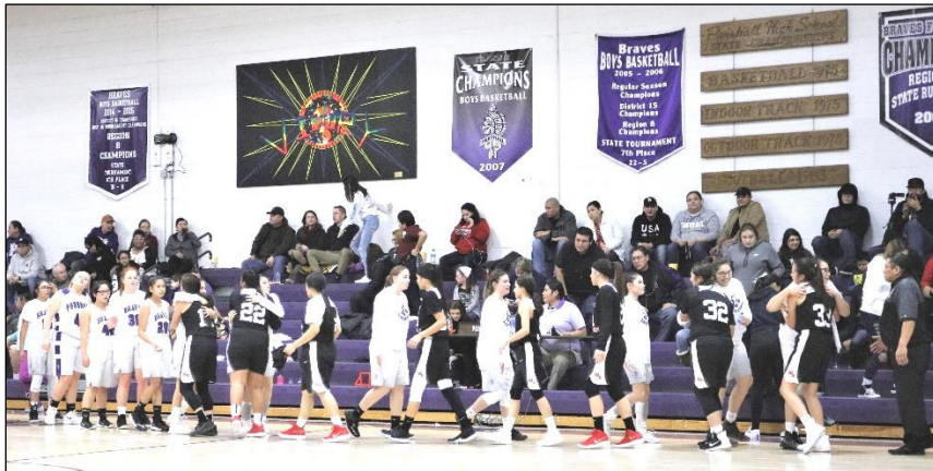
White Shield Lady Warriors and Parshall Braves shake hands at end of game.