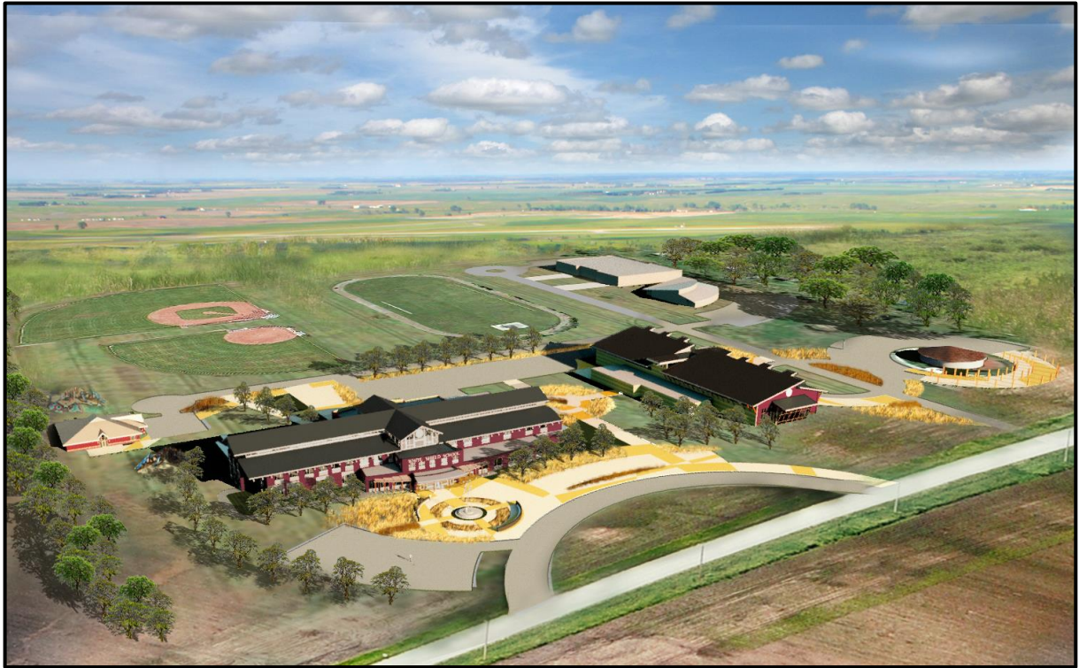
Ariel view of the new school, community building and headstart as they sit next to the Culture Center.

The White Shield school was also built in 1953 and needs to be replaced. It will be built with oversight of the BIA, but will be funded by the tribe. The BIA will be responsible for operation. It will also set in an area near the Culture Center and near the Community Center where some of the school activities can happen at the Center.