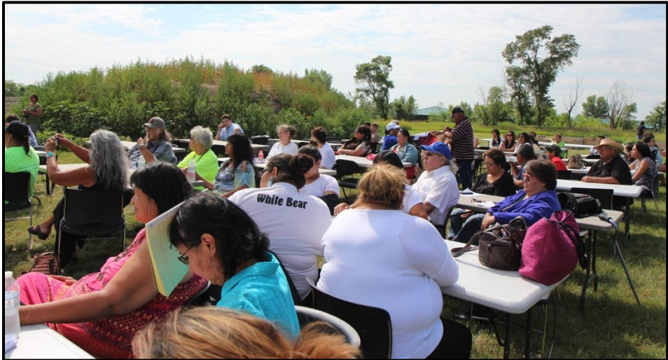
Ground breaking has large turn out