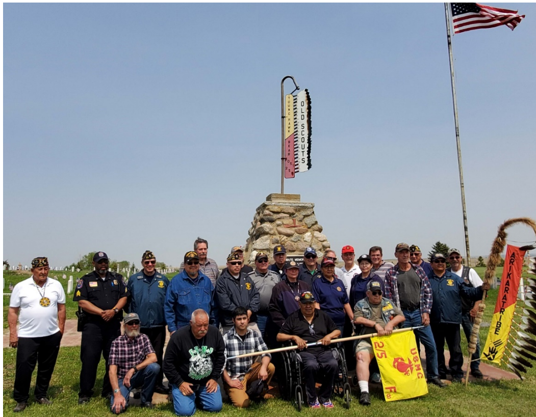
Local and visiting veterans honor veterans today.