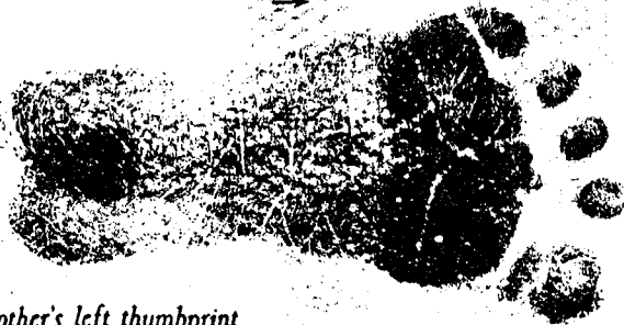
Baby's left footprint