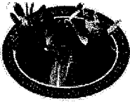
EXHIBIT A CERTAIN LEGAL PROVISIONS